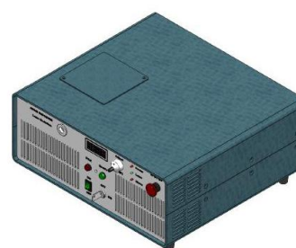
370 (L) ×406 (W) ×188 (H) mm 3