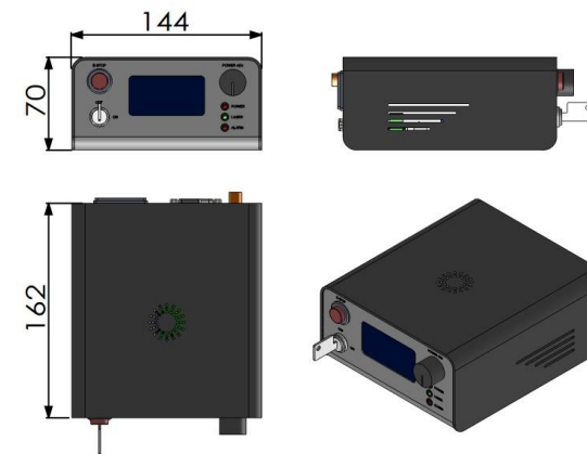
162(L) × 144(W) × 70(H) mm 3 , 1.0kg