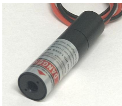
Φ12×50(L) mm 2